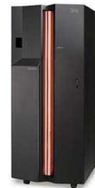
The powerful IBM zSeries 800