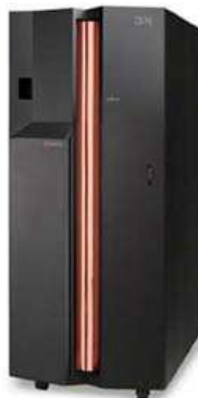
The powerful IBM zSeries 800